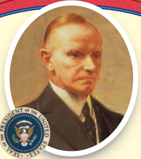
CALVIN COOLIDGE 1872–1933

Stepping into office in 1923, the tightlipped Vermonter was respected for his solemnity and wisdom. Coolidge supported American business and favored what he called “a constructive economy.”