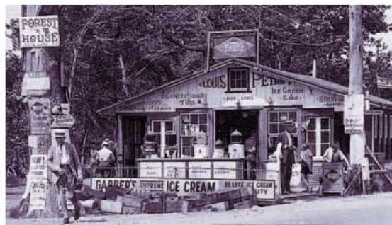
Roadside stands offering food, drink, and other items appeared in increasing numbers.

The “Auto Camp” developed as townspeople roped off spaces alongside the road where travelers could sleep at night.